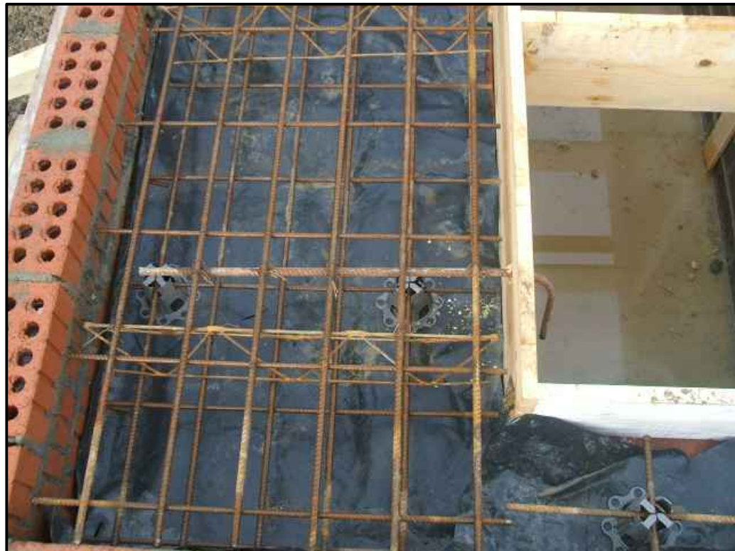
TYPICAL EXAMPLE SHOWING EARTH BAR CONNECTED TO REINFORCEMENT MESH IN FOUR POINTS