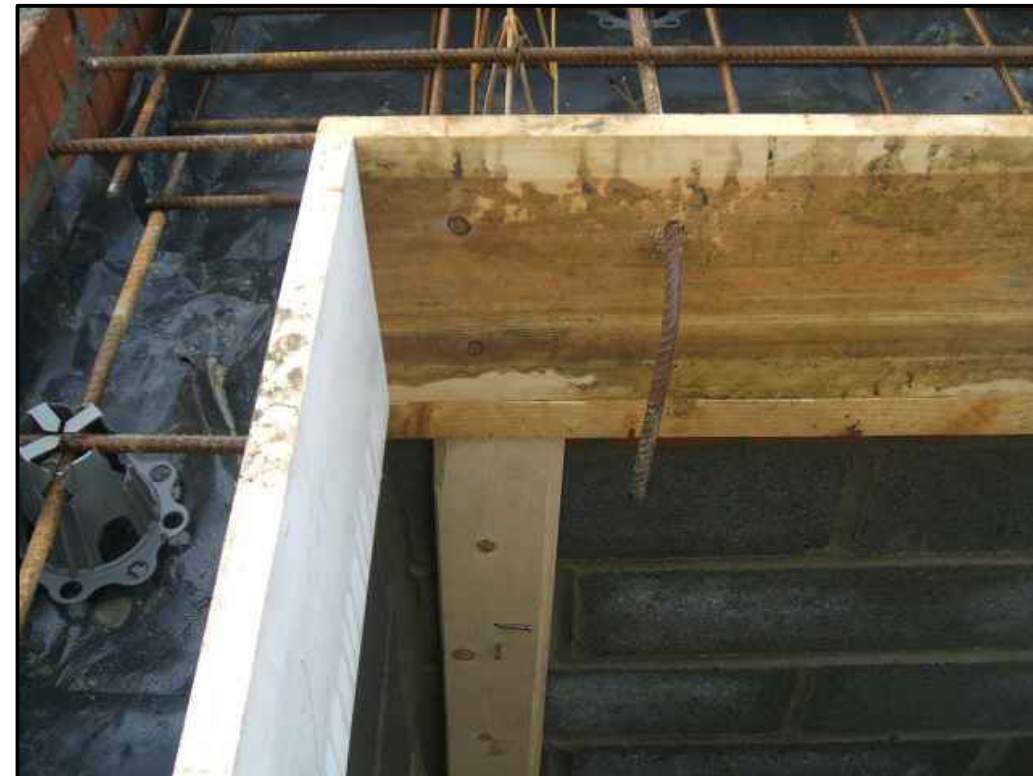
TYPICAL EXAMPLE SHOWING EARTH BAR PROTRUDING 50mm INTO TRENCH TO ALLOW CONNECTION TO BE MADE