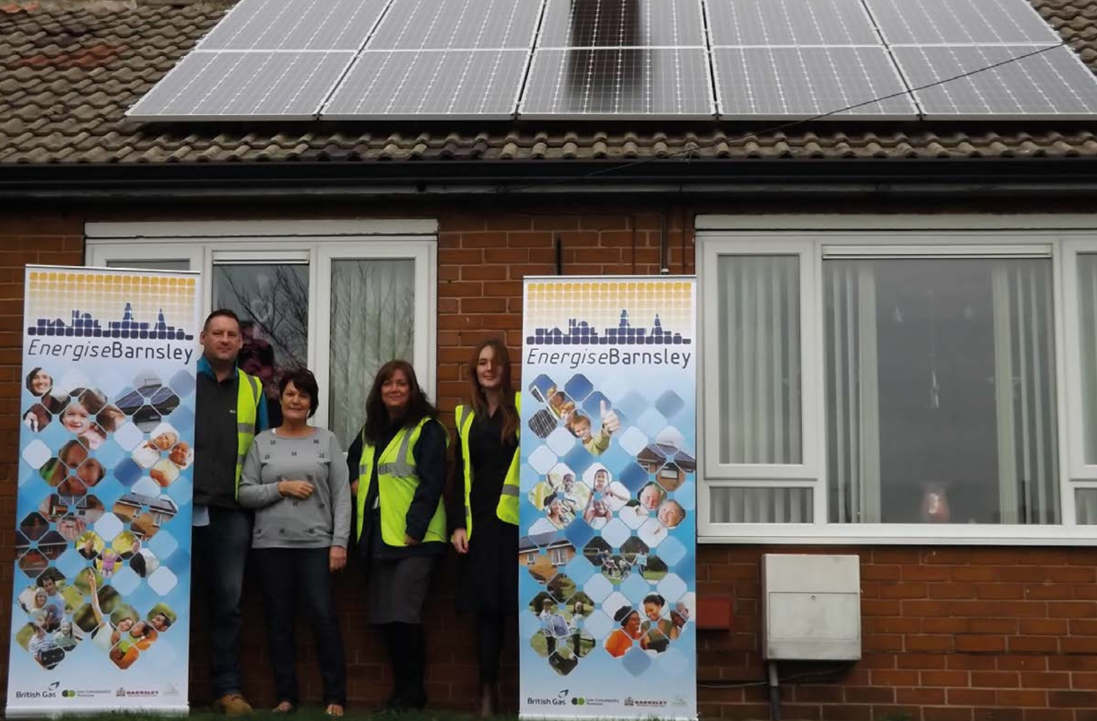
Photo: Energise Barnsley Community. (For more information see case study link on pg 10).