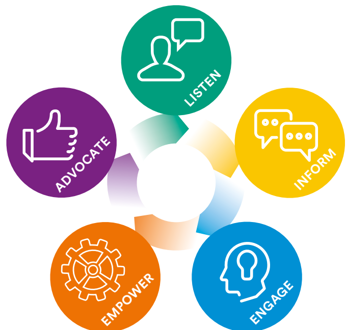
Figure 2: Northern Powergrid's approach to engagement.

We recognise these organisations as trusted intermediaries, with local connections who are delivering outreach and engagement activities of their own, focussed on the environmental, social and local economic impacts of our energy system. By supporting and collaborating with these local organisations more, we believe we can achieve more impact and fairness in our energy system.