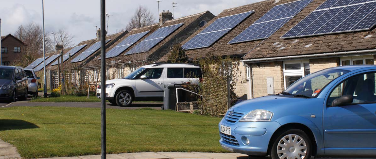
Photo: Energise Barnsley community rooftop solar. (For more information see case study link on pg 10).