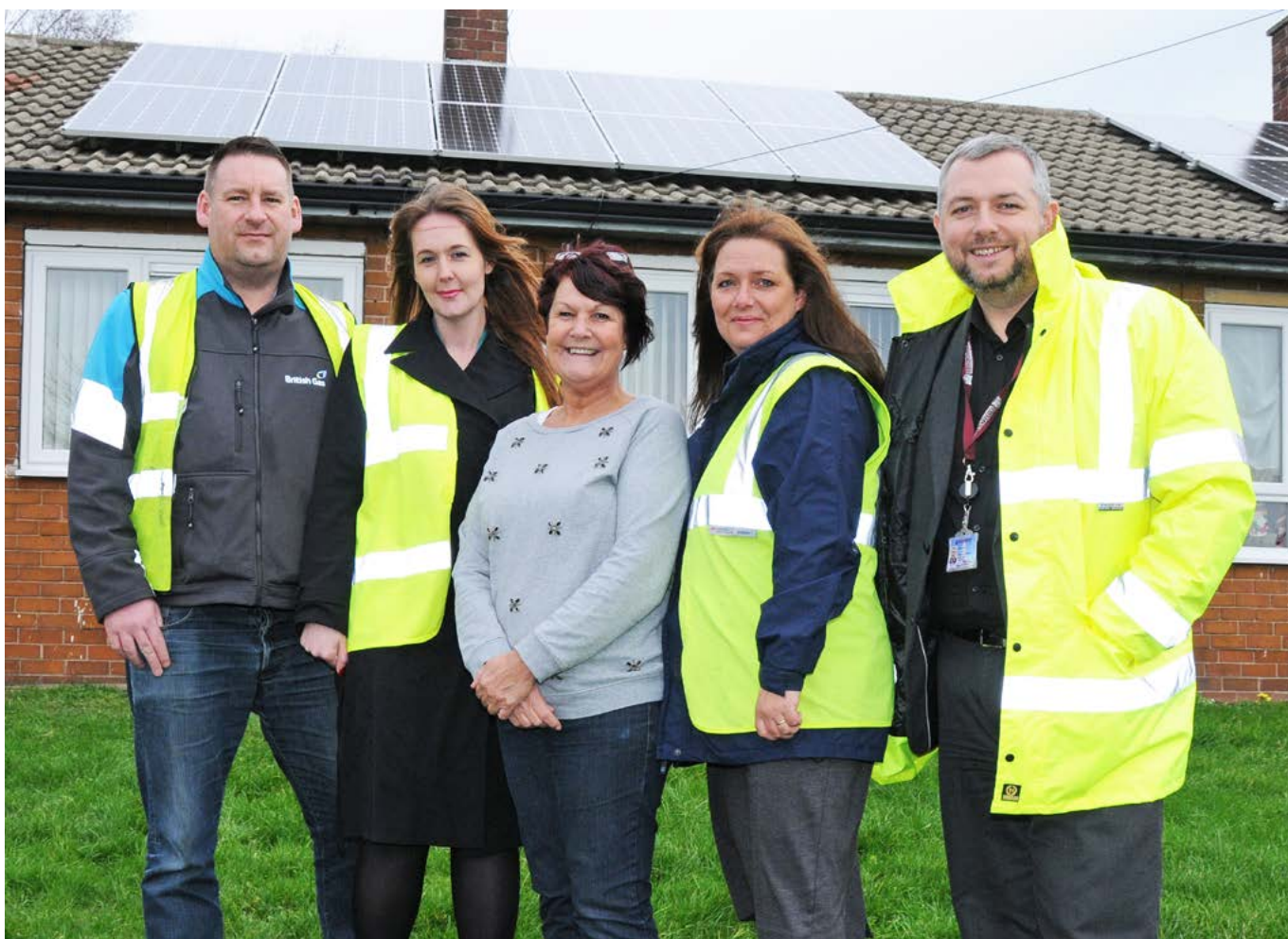
Photo: Energise Barnsley 4 community rooftop solar.